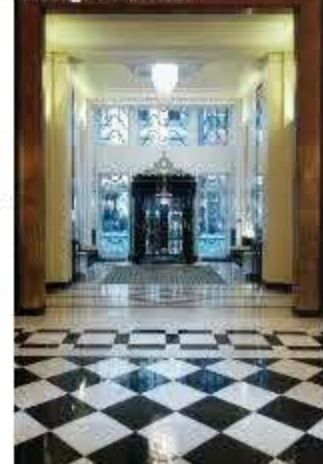
The stately lobby at Claridge's in London.