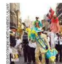
Mardi Gras in New Orleans.